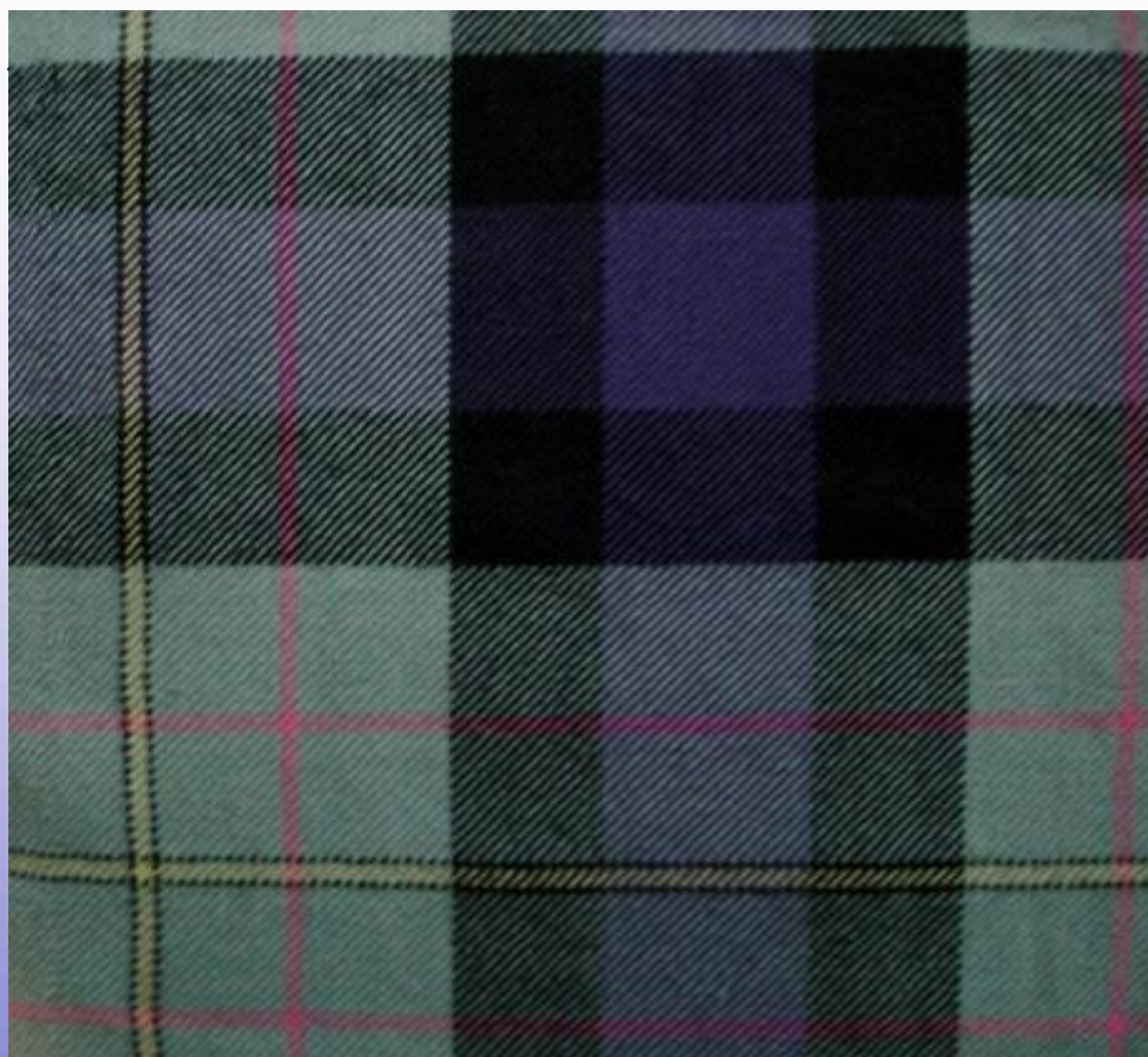
Ancient II (Purple)