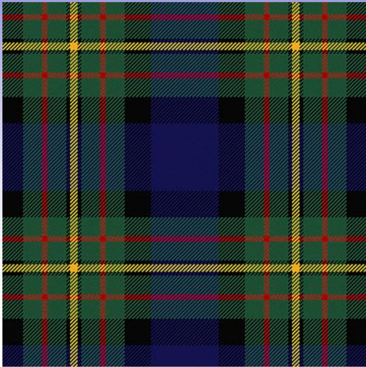
Modern (Dark Blue)